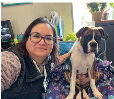
PHOTO: OBI, OUR VOLUNTEER SUPPORT DOG ON TUESDAYS

All ECHO staff and volunteers have compassion and serve our neighbors in need with dignity and respect each and every time they come in. All of us together with our donors combine our powers to help our neighbors in need with food, housing and other supportive services! If you want to learn more about how you can share your powers with ECHO, please reach out to me directly or visit us on the 1 st Tuesday of each month at 5:00pm for a tour of ECHO and learn about volunteer opportunities. Planeteers... The rings are not the source of your power. The real power to save Earth comes from within; inside you. It always has. — Gaia from Captain Planet.