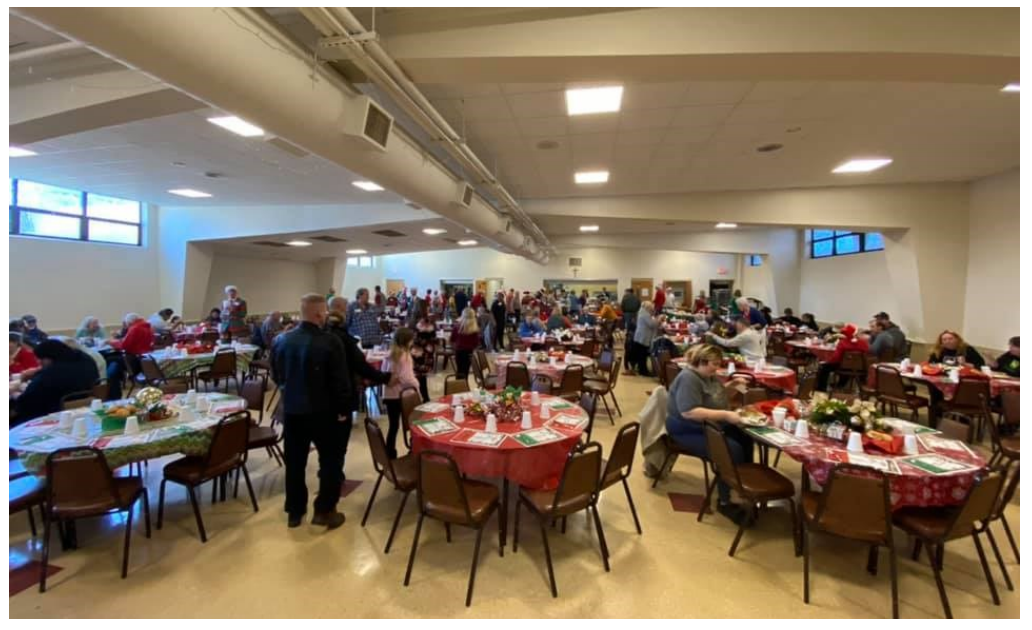
The ECHO Times